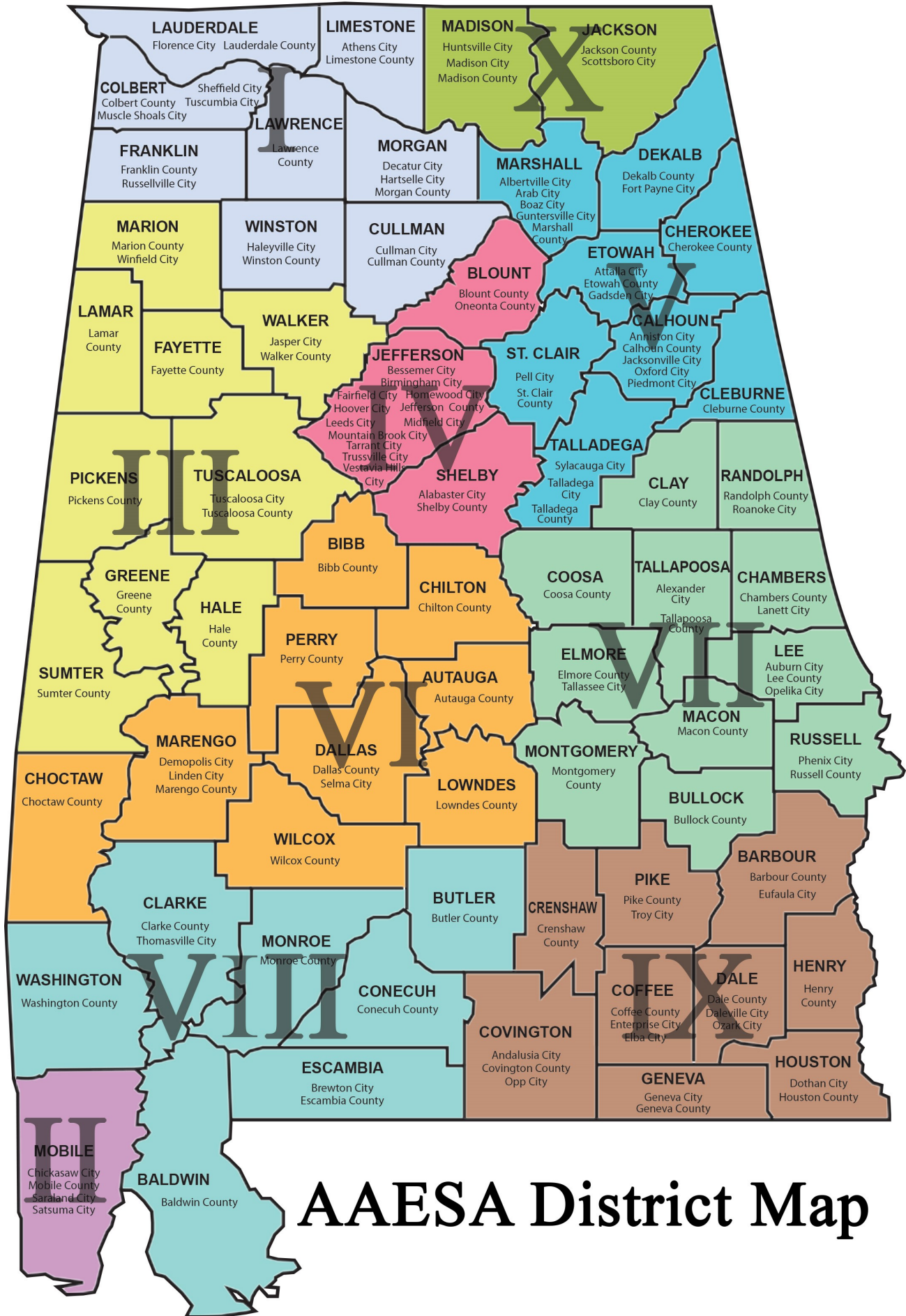
AAESA District Map