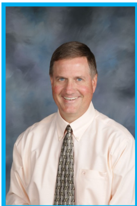
Waller Martin Enterprise Early Education Center Enterprise City

Enterprise Early Education Center has been open for over 13 years. And for the first time we welcomed our first; first through sixth grade students for the 2021-2022 school year.