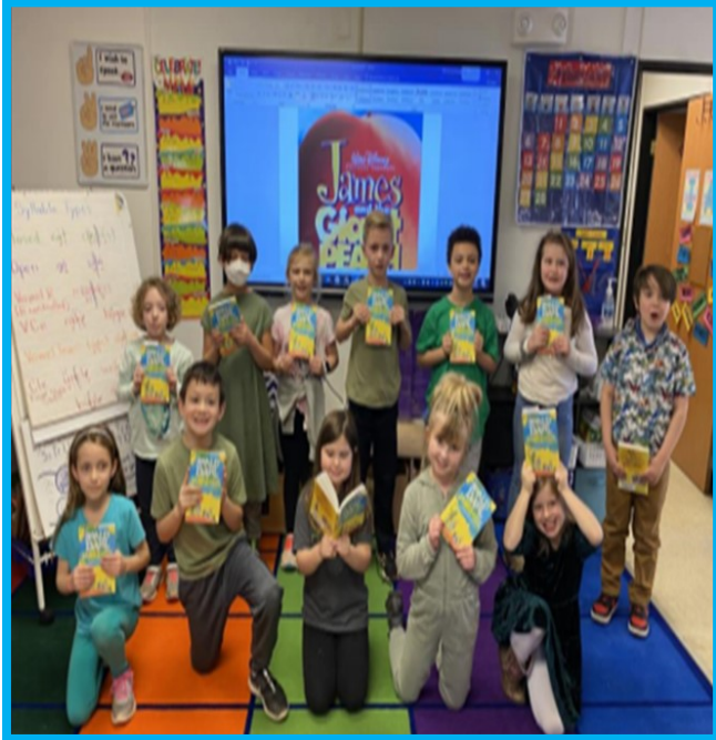
Kilby students receiving their own copies of “James and the Giant Peach”.