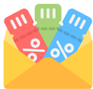
Discounts on CLAS Conferences