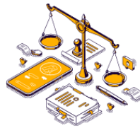
Legal Defense (Up to $25K Lifetime)