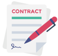
Contract Review Service