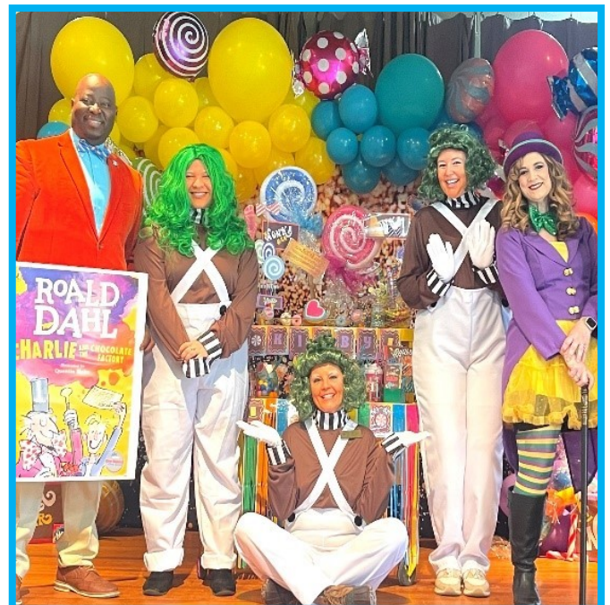
The Kilby faculty help bring the Willy Wonka characters to life!