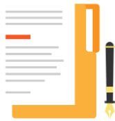
Access to Sample Contracts