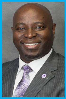
Eric Kirkman Kilby Laboratory Florence City

Motivating kids to read can sometimes be a daunting task. Finding the right titles or topics of interest can be difficult,