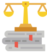
Access to Legal Counsel