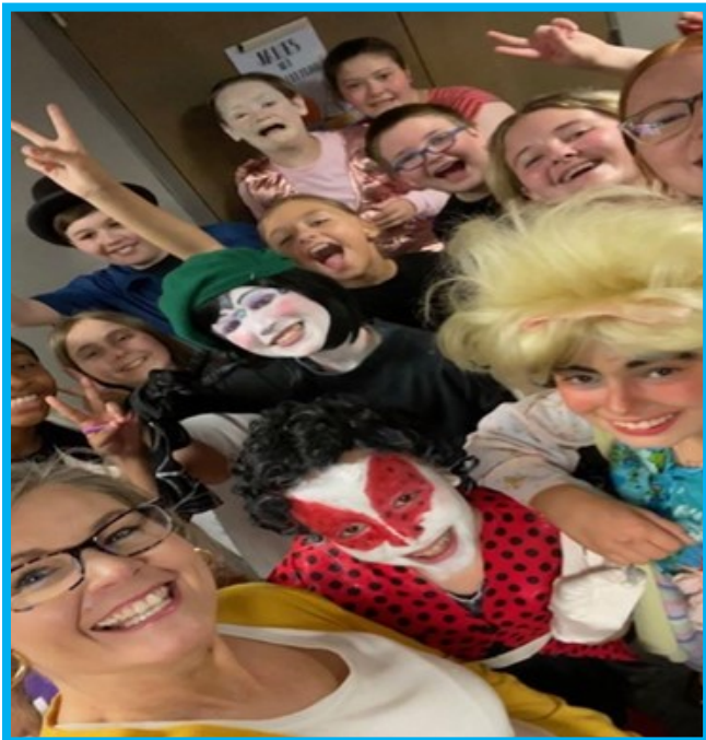
The cast of “James and the Giant Peach” prepare for another great performance!